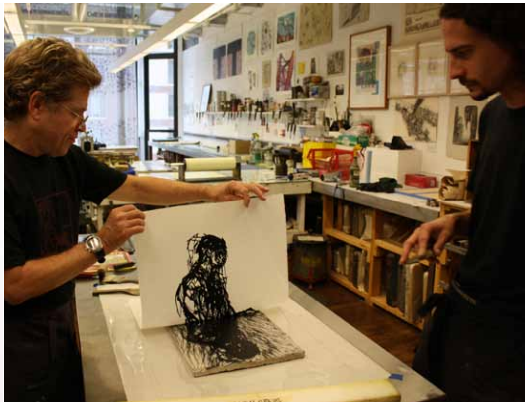
ARTHUR DANTO POSTURE OF CONTEMPLATION WOODCUT 12" X 17 ½" 1958 / 2009