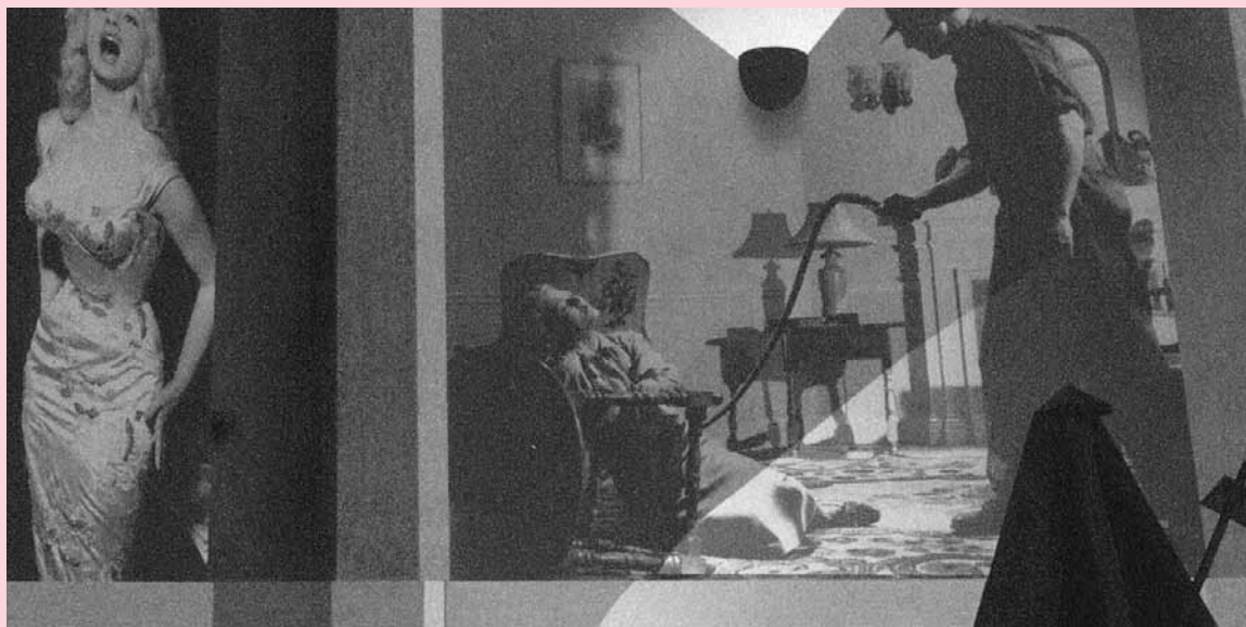
NICHOLAS SISTLER WITHIN EAR SHOT PHOTOPOLYMER INTAGLIO PRINT 6" X 3" IMAGE SIZE 10" X 7 1/4" PAPER SIZE 2009

HOTEL SUITE IS A SERIES OF 15 PHOTO POLYMER INTAGLIO PRINTS CREATED BY NICHOLAS SISTLER AND EDITED BY ANCHOR GRAPHICS. THIS IS A DESCRIPTION OF THE PROJECT IN THE ARTIST'S OWN WORDS.