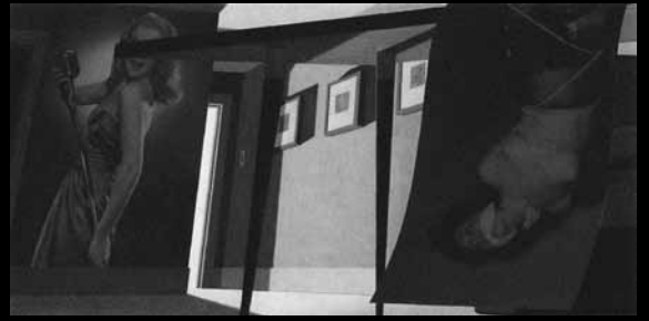
LODGING FOR THE UNINVITED