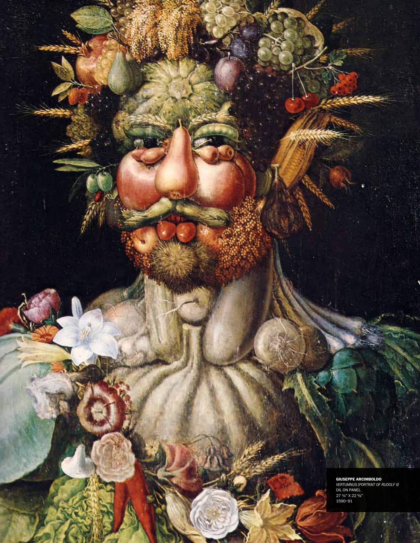
GIUSEPPE ARCIMBOLDO VERTUMNUS (PORTRAIT OF RUDOLF II) OIL ON PANEL 27 3/4" X 22 5/8" 1590-91