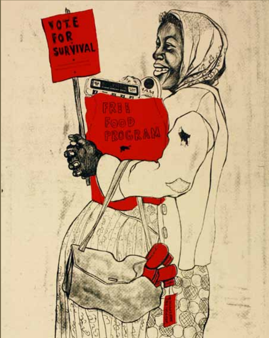
EMORY DOUGLAS, VOTE FOR SURVIVAL , SCREEN PRINT, 15" X 20 1/2" PAPER SIZE, 14 1/4" X 19" IMAGE SIZE, 2009

Anchor invites artists from around the country to come to the shop and create limited edition prints in collaboration with our master printers. Both the artists and Anchor Graphics benefit from these partnerships by sharing ideas and splitting editions. Anchor's prints are available for sale to the public, providing an important source of revenue for Anchor's programming. All the costs of these projects are covered by Anchor Graphics.